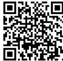
Find out the cultural events

Today, around 700 students are enrolled in the Academy.