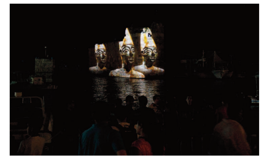
A 3D projection is shown on the walls of Byblos maritime citadel

"The impact of the 3D projection allows you to absorb information that you don't get by reading a book or a brochure."