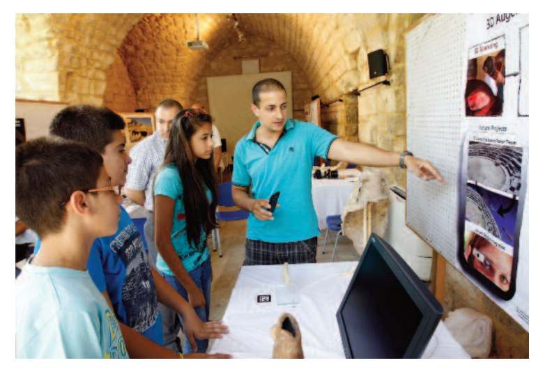
Here is the "augmented" part of a vase: it's a 3D archaeological reconstruction made possible by special software

vase that was found in the sea. Of course its 'augmented part' is not awe-inspiring, but already one can get an idea of the interest of the project and how it works. The second stage will be to rebuild the Roman amphitheatre, which is near the fortress of Byblos, in three dimensions. A historical study will ensue. The aim is to create a play with characters from that era that tourist could watch as if they were there on the spot hundreds of years ago.